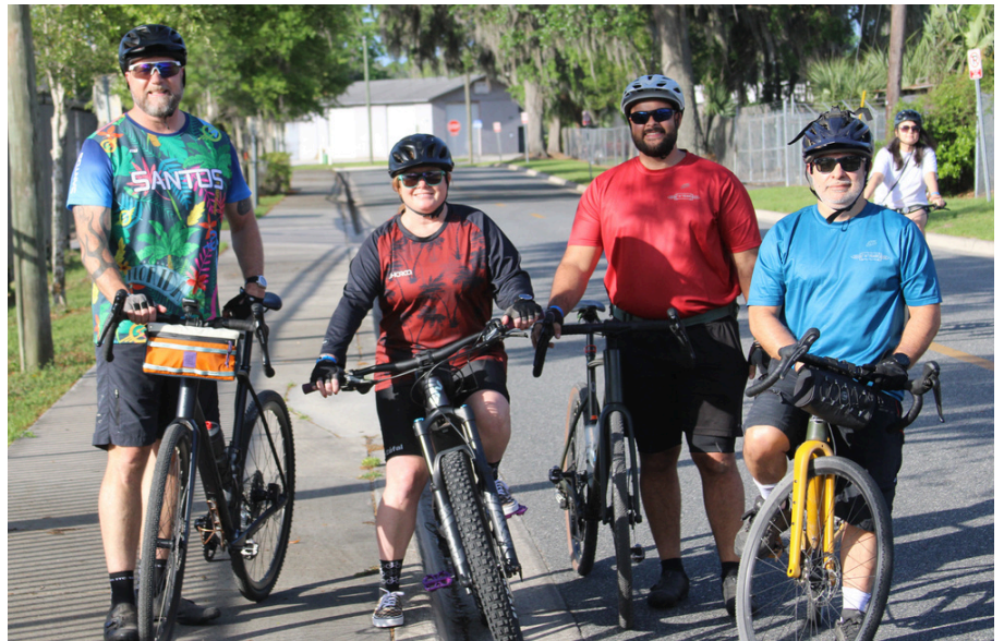
Riders included GOC Members, community leaders, family and friends.