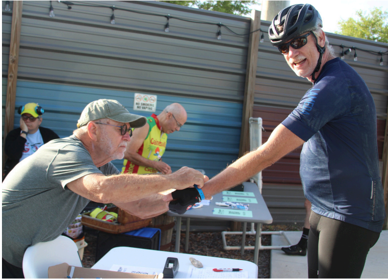
GOC Bike Day kicked off on April 5 th with riders getting registered and ready to ride!