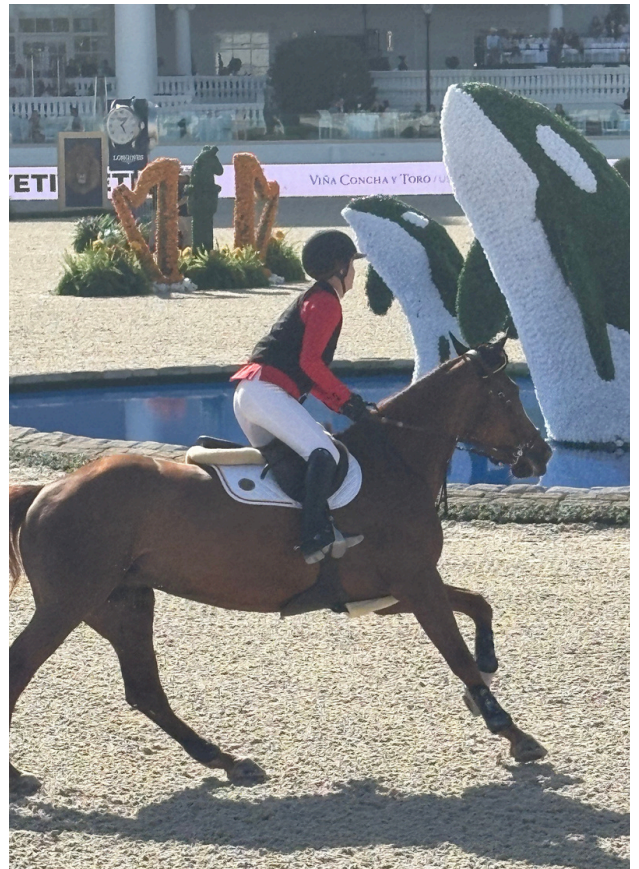
We discovered many Members had never been to an esquestrian event.