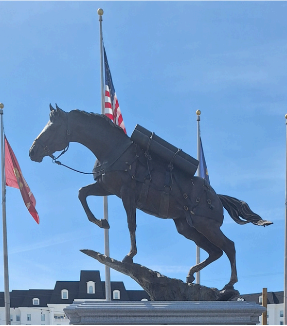
It was a beautiful day at the Ocala Equestrian Center.