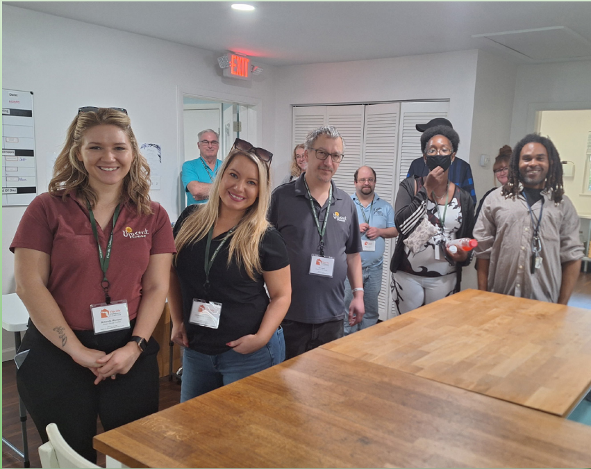
The whole crew from the Vincent House. Vincent House was the first Clubhouse in Florida.