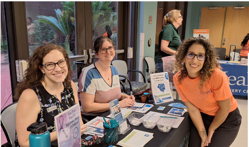
More of our Community partners at an event to bring awareness to drug overdose