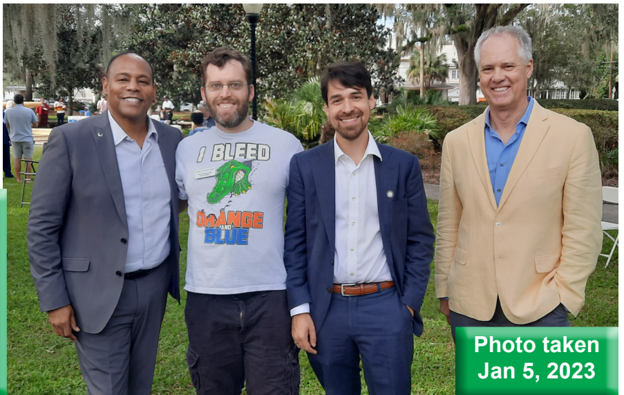
Photo taken Jan 5, 2023