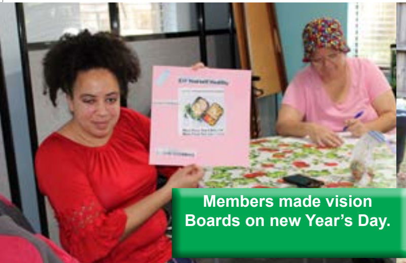
Members made vision Boards on new Year's Day.