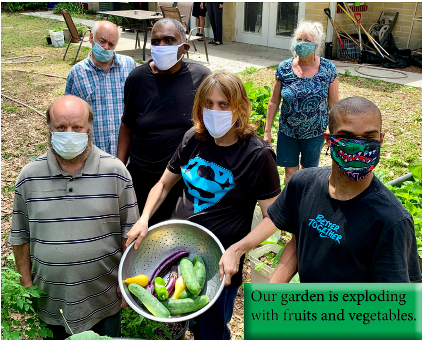
Our garden is exploding with fruits and vegetables.