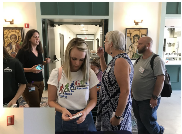
Photos from the Mental Health Symposium.