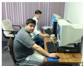
Members in Computer Lab