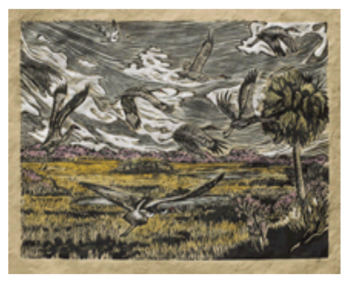
Poster image for 2008

from all over the world including gyros, jambalaya, fish and chips, and barbecue ribs. Are you looking for parking? Two blocks west of Main Street is the City parking garage. It costs five dollars for one day's use, and is open twenty four hours a day.